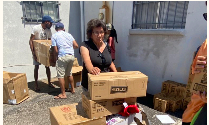
RCCG RIVERS OF LIVING WATER, NM