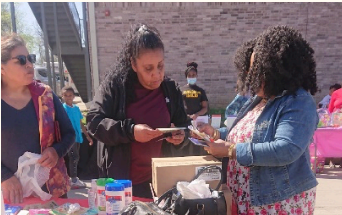
RCCG IMMANUEL CHAPEL SOUTH DALLAS, TX

RCCG DOMINION PALACE HELD THEIR COMMUNITY OUTREACH PROGRAM TO SENSITIZE THE COMMUNITY ABOUT THEIR PARISH AND TO ENGAGE THE ATTENDEES IN EVANGELISM