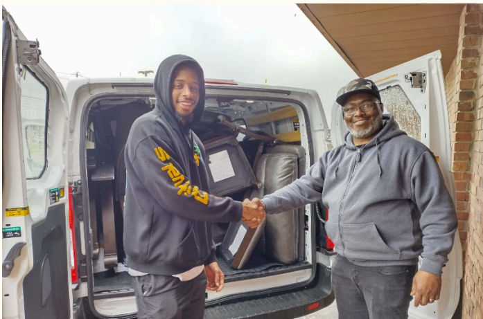
HOUSE OF PRAYER INTERNATIONAL