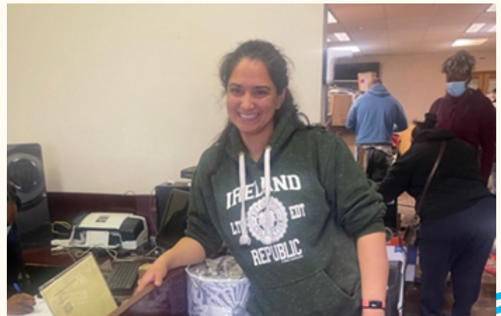
RCCG HOUSE OF HIS GLORY, UTAH